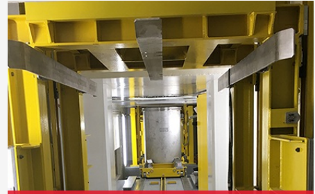
Orano La Hague - Transfer and filling line for Silo 130