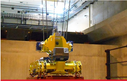
EDF - High-integrity handling and conveyor system for ICEDA facility